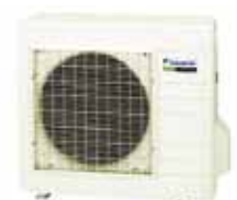
Outdoor unit RXS50J