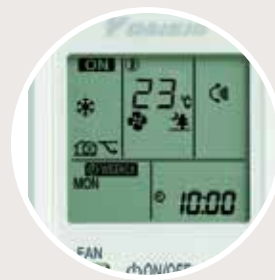
Infrared remote control (Standard) ARC452A1