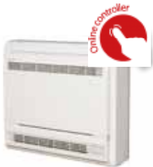
Indoor unit FVXS25,35,50F

(1) Energy label: scale from A (most efficient) to G (less efficient) (2) Annual energy consumption: based on average use of 500 running hours per year at full load (nominal conditions) (3) Cooling: indoor temp. 27°CDB, 19.0°CWB; outdoor temp. 35°CDB; equivalent piping length: 5m; level difference: 0m (4) Heating: indoor temp. 20°CDB, outdoor temp. 7°CDB, 6°CWB; equivalent refrigerant piping: 5m; level difference: 0m